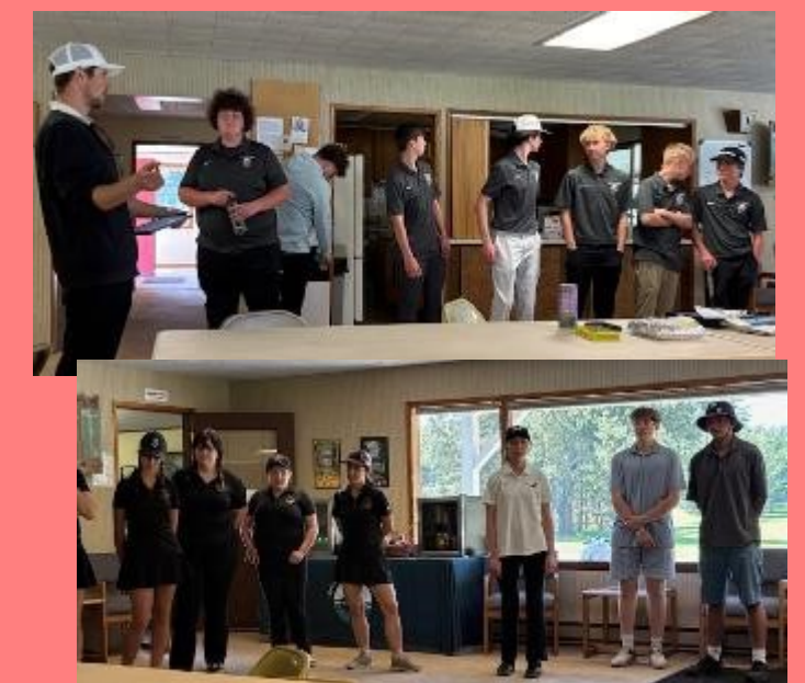
Getting ready for April 24 match against Friday Harbor.