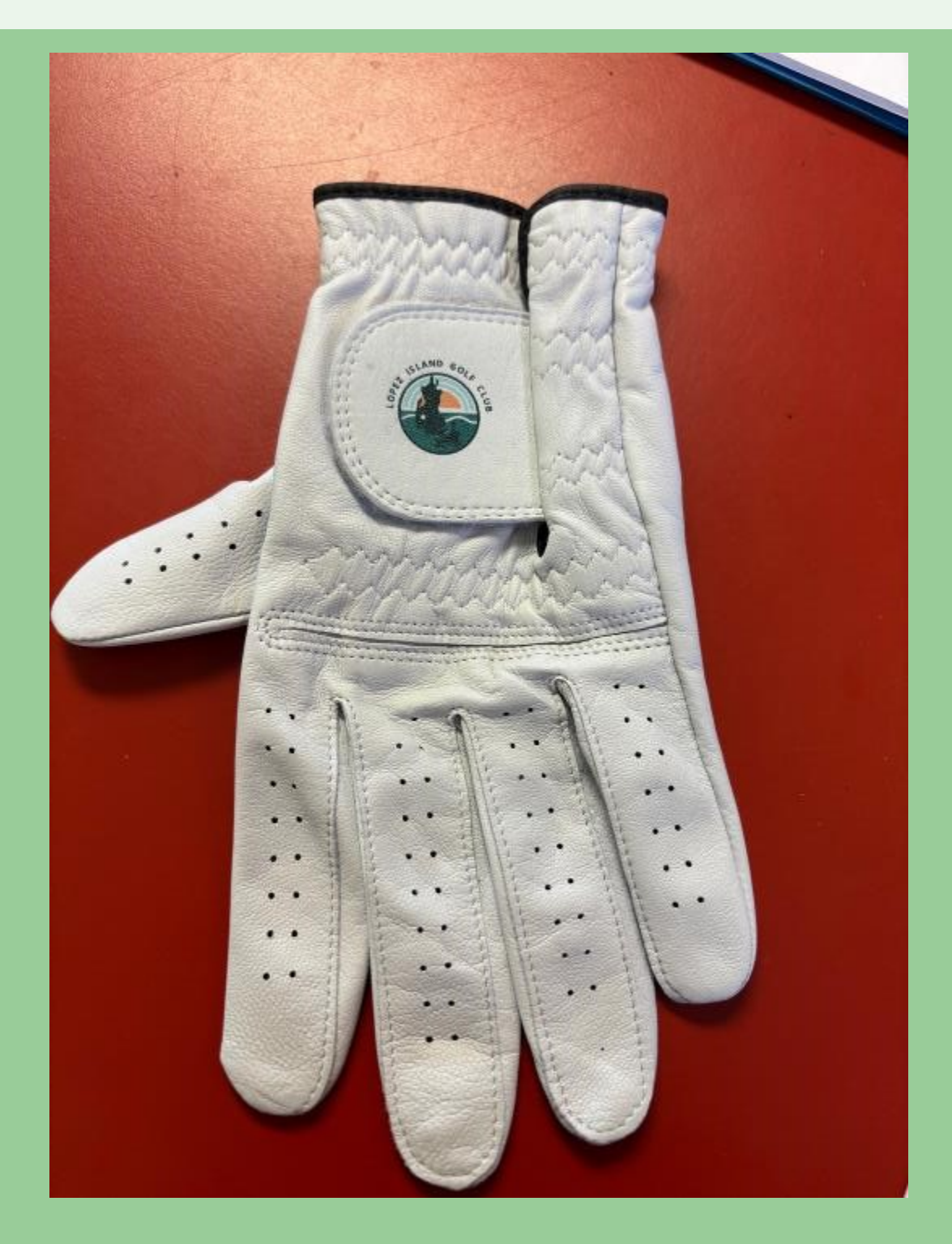
Only $20 for members!