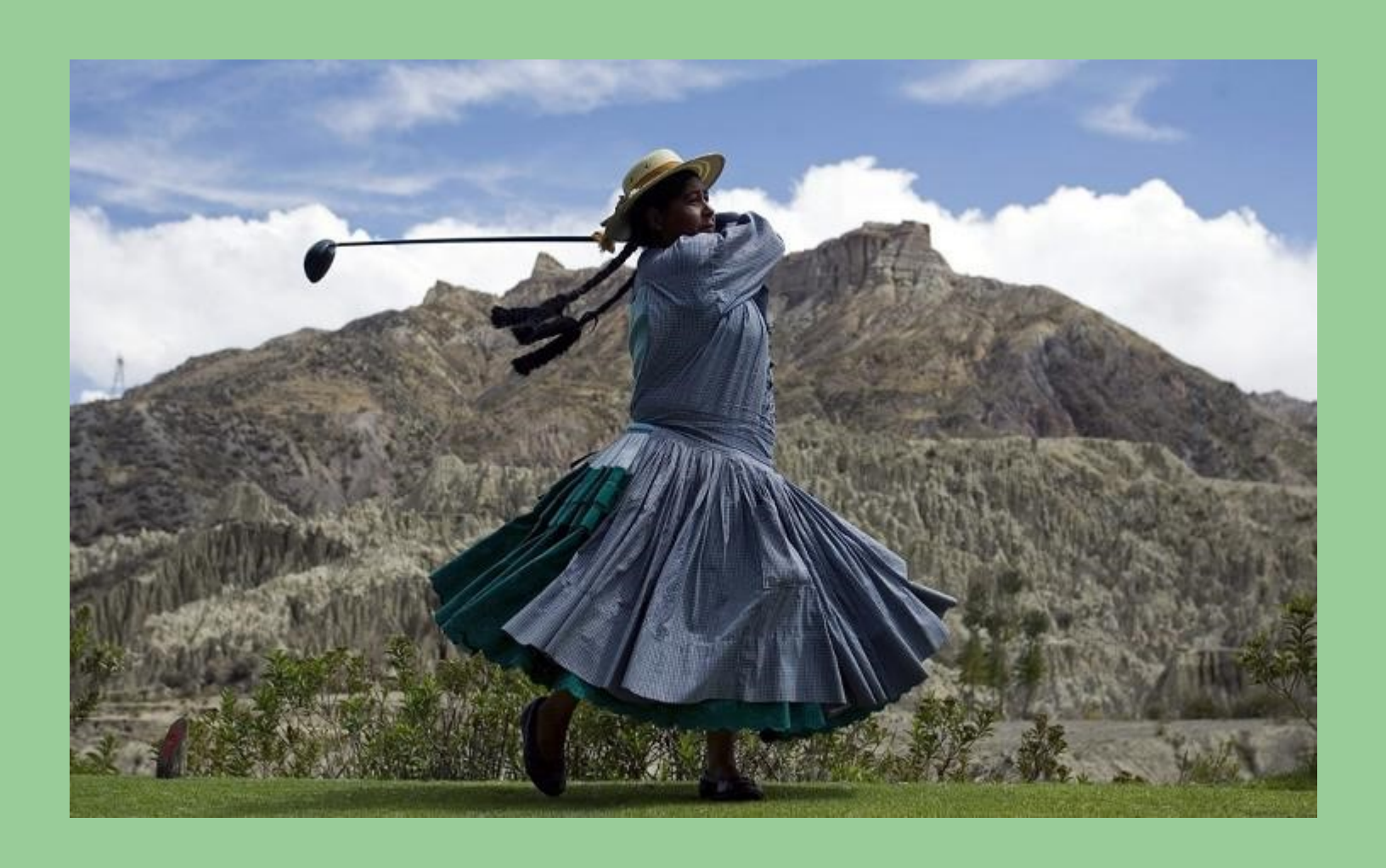
Golfing in Bolivia!