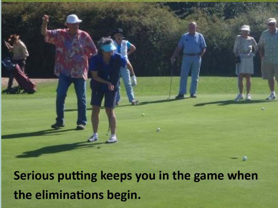
Serious putting keeps you in the game when the eliminations begin.