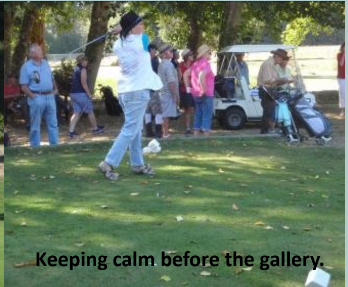
Keeping calm before the gallery.