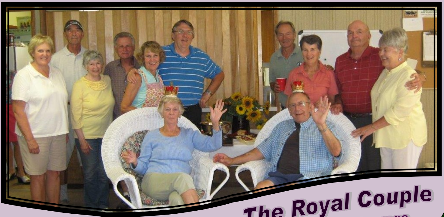
The Royal Couple and their entourage