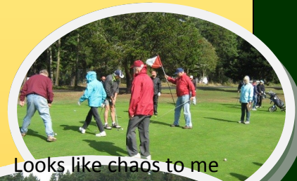
Looks like chaos to me