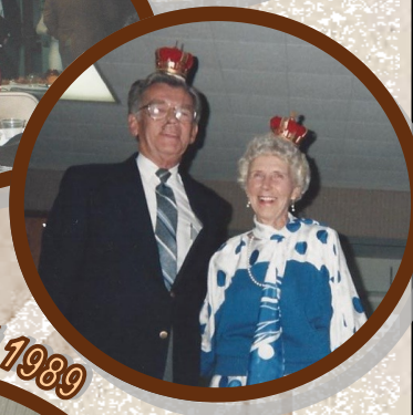
Awards Banquet 1989