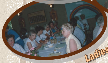
Ladies' Fun Day 1988