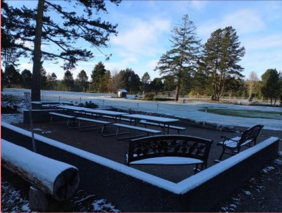
First Snow on November 7