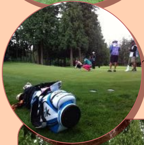
Lexi Thompson In the pink