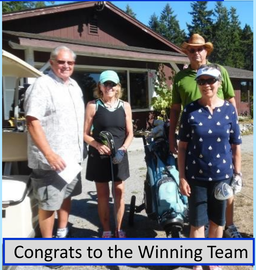
Congrats to the Winning Team