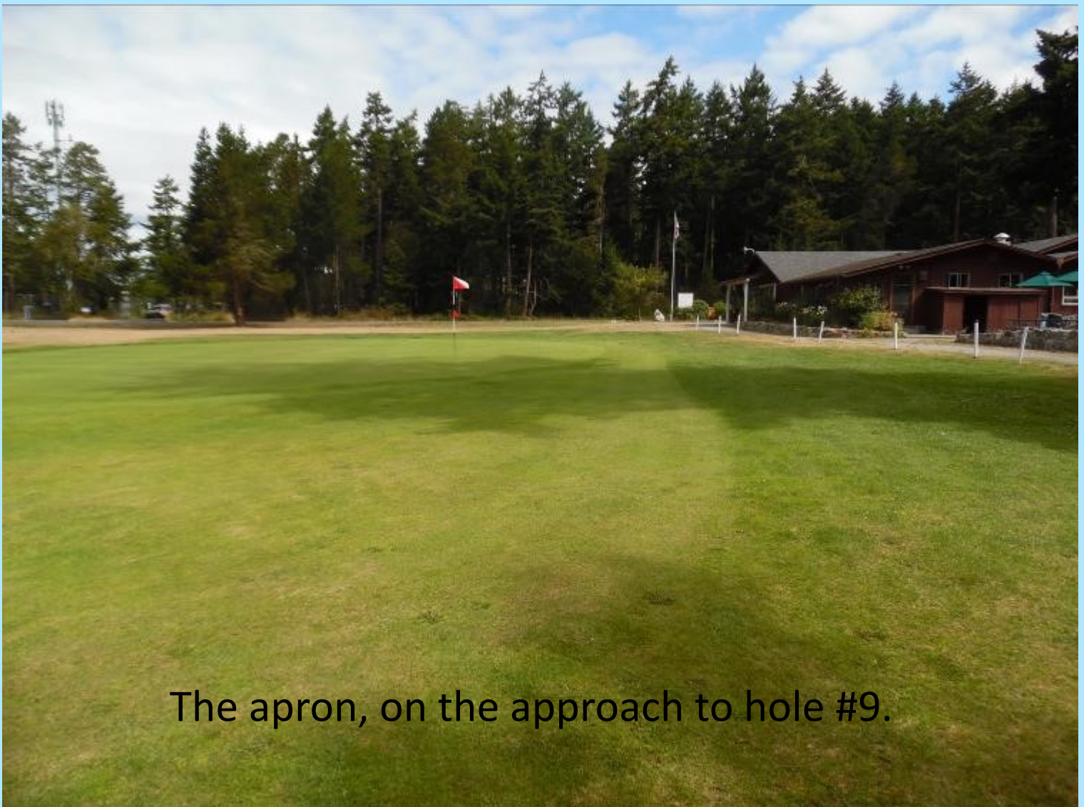
The apron, on the approach to hole #9.

Answer: An apron is an area of grass in front of some putting greens where the fairway transitions into the greens. The grass of an apron is cut to a height slightly lower than that of the fairway, but slightly higher than that of the green. An apron is a design choice on golf courses. In other words, the Course Superintendent may choose to put aprons in play or not.