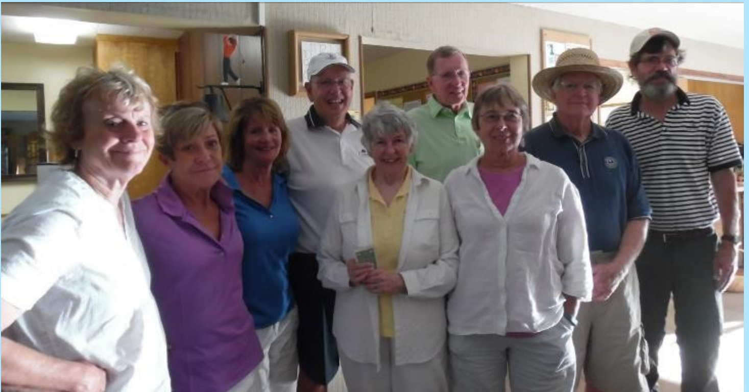
Some of the second place finishers, from three of the tied teams.