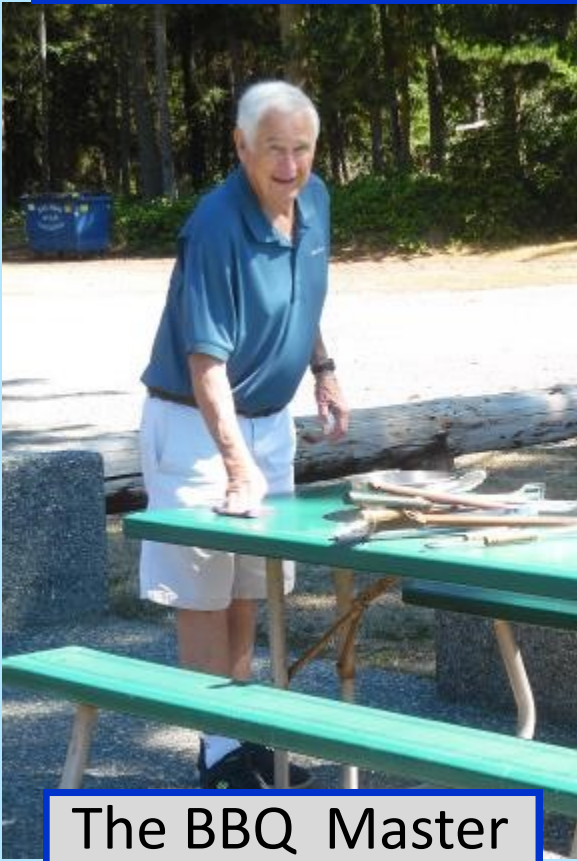
The BBQ Master