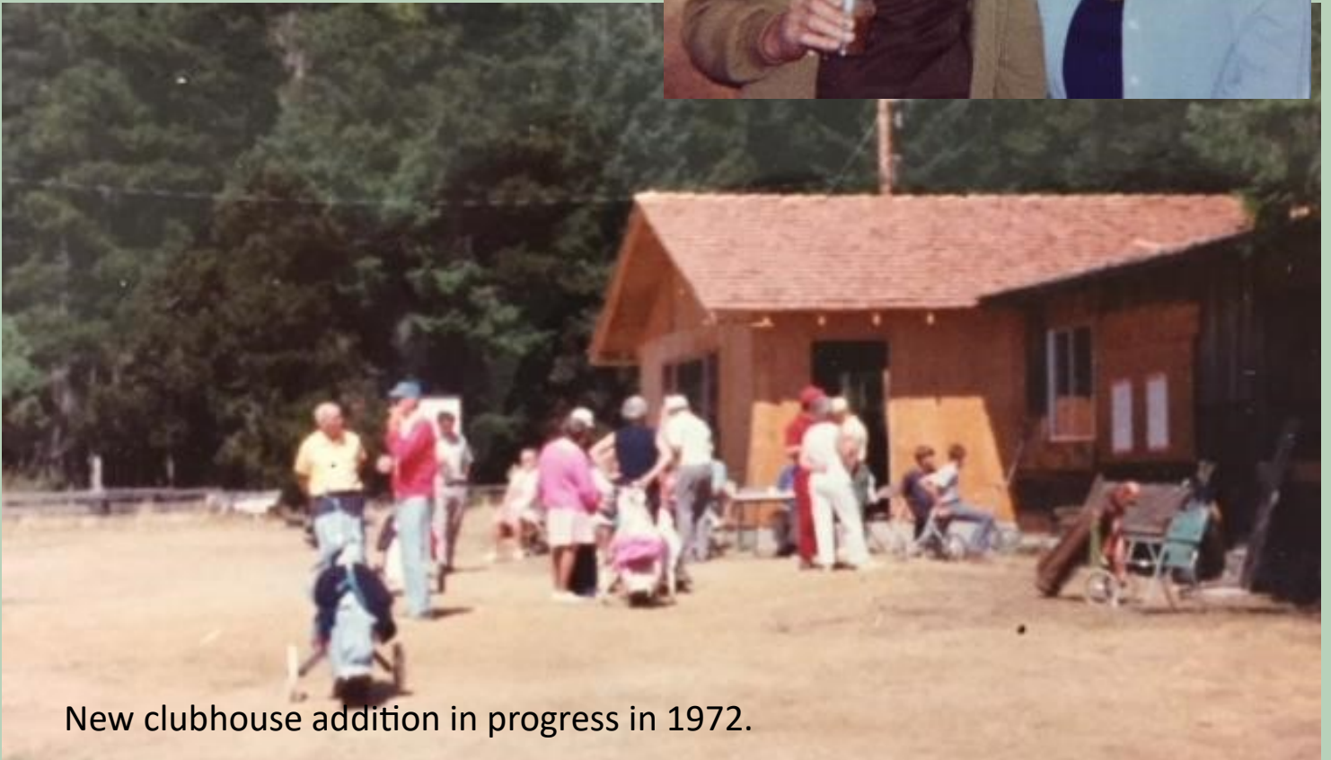
New clubhouse addition in progress in 1972.