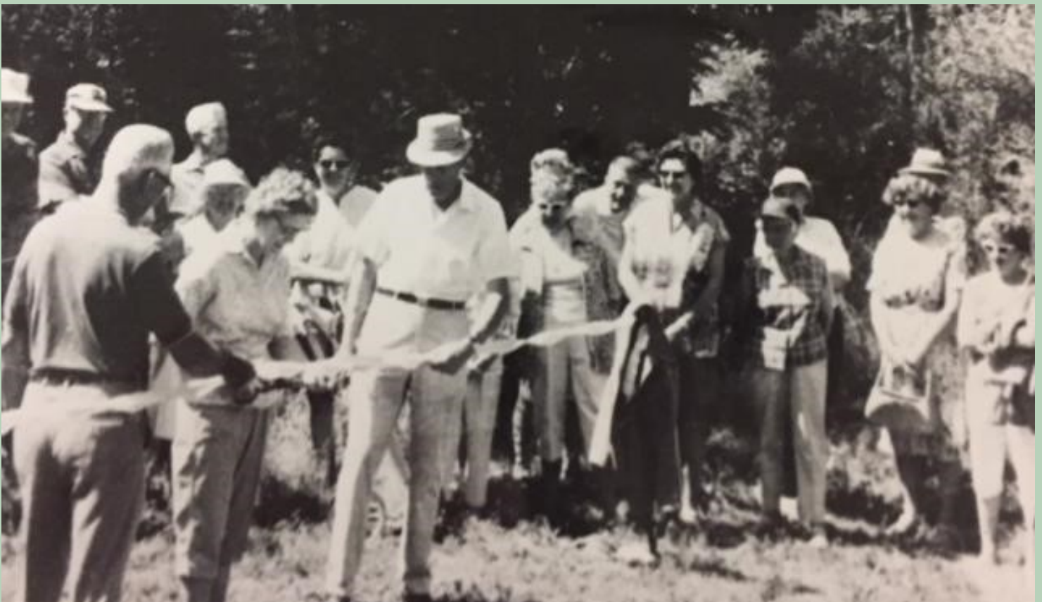
Dedication Ceremony of the #6 Fairway in 1967. There was an additional dedication when the green was opened a year later on July 14th, 1968.