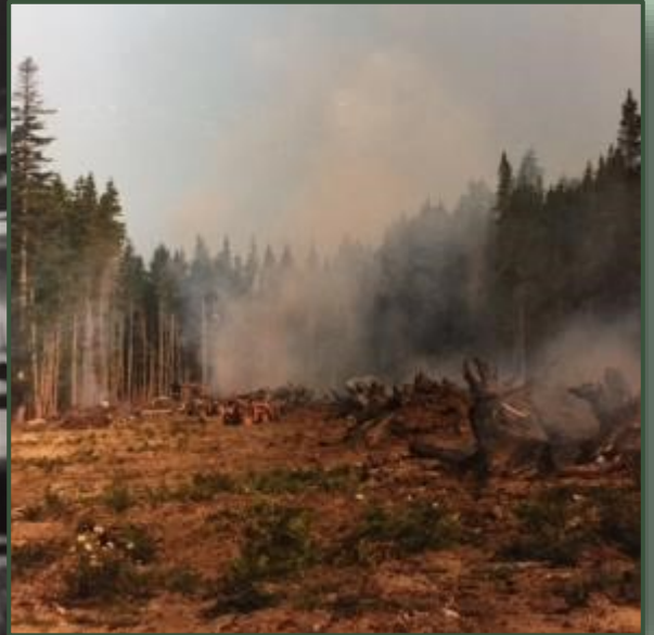
Clearing of the 6th fairway.