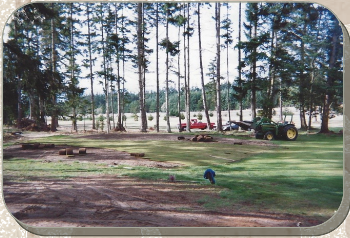
New sod #8 1992