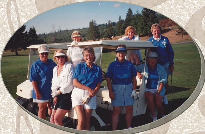
The traveling ladies 1994