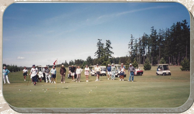
The Horserace 1994