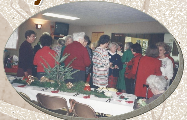
Ladies Christmas Luncheon 1992