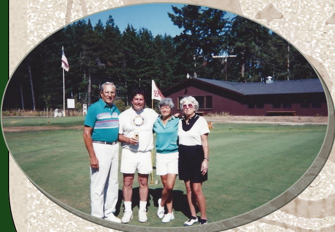
Club Championship 1992