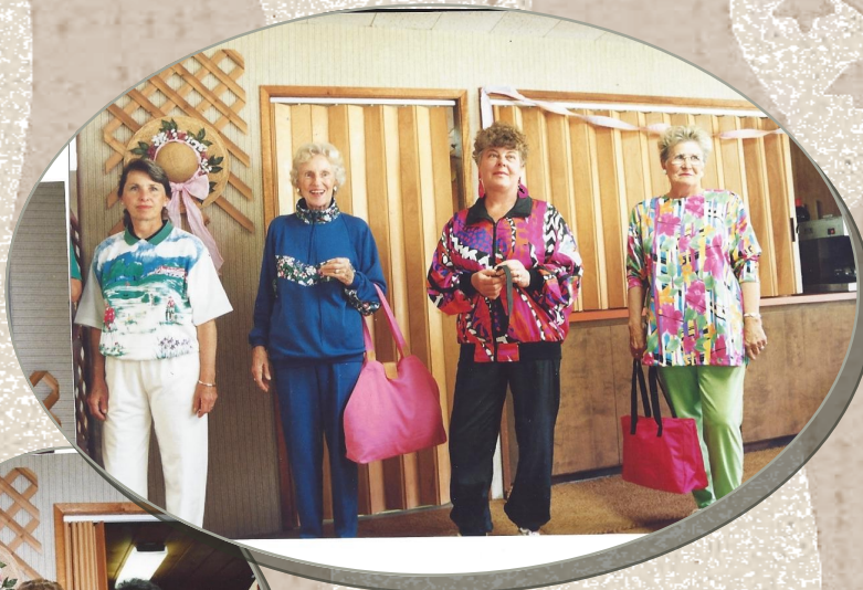
The Fashion Luncheon 1993