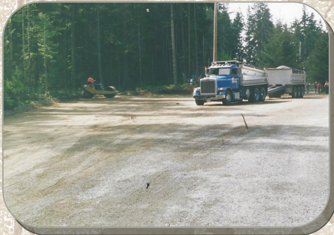
Improving the parking lot 1995